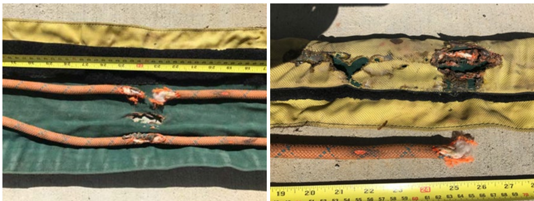
Figure 2: Damaged ropes and rope protector